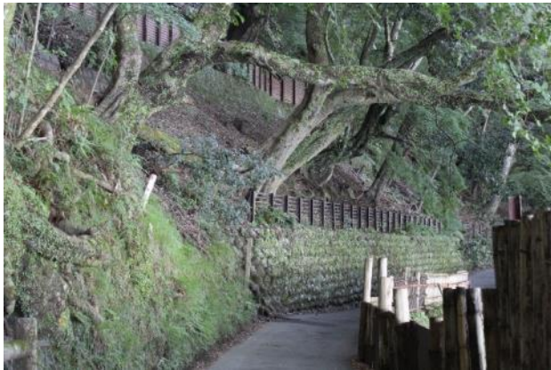
Arshiyama walk – path between the river and the forested area