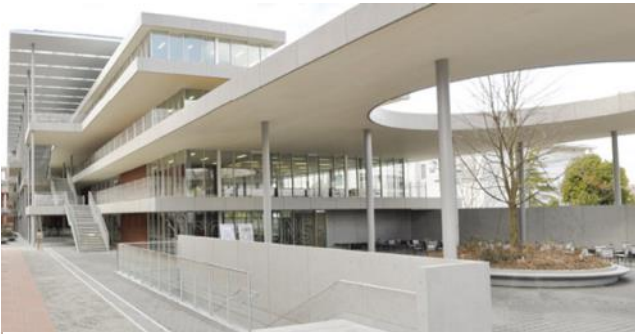
Fukakusa Campus, Ryukoku University